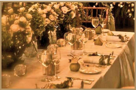
An ethereal evening

On August 12th , join us for a Rockin' Lunch. It's National Elvis Week and we're celebrating with a 50's diner themed meal, complete with peanut butter banana ice cream sundaes - PB&B was the King's favorite flavor combo!